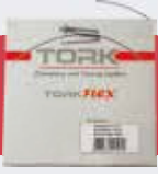
12mm METAL RULO KELEPÇE & BAĞLANTI KLİPSİ