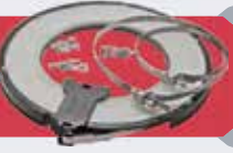
9mm METAL RULO KELEPÇE & BAĞLANTI KLİPSİ