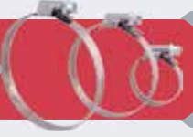
KABARTMALI HORTUM KELEPÇELERİ