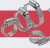
AYARLI HORTUM KELEPÇELERİ