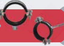
DOĞALGAZ BORU KELEPÇELERİ